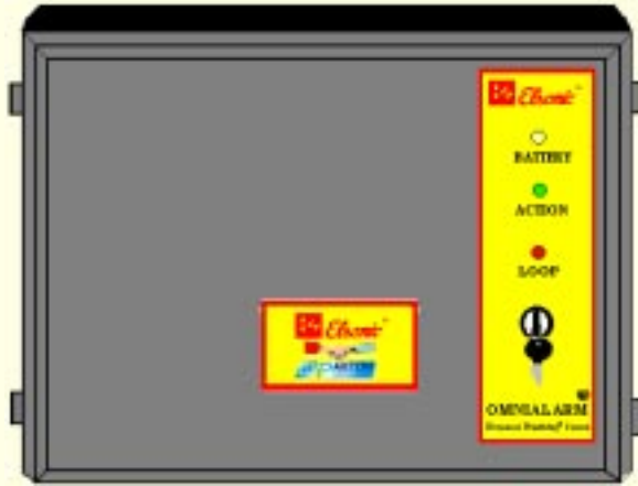
Omnilarm Single-Zone basic model