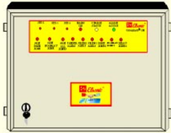
Omnilarm 3-Zone Multi-option model